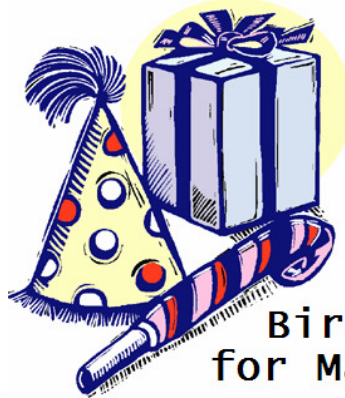
Birthdays for March